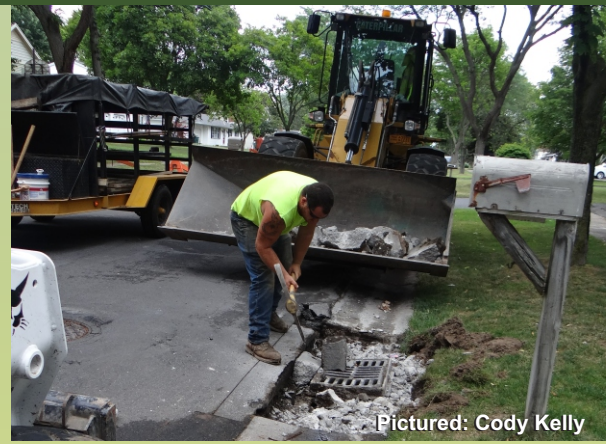
Pictured: Cody Kelly