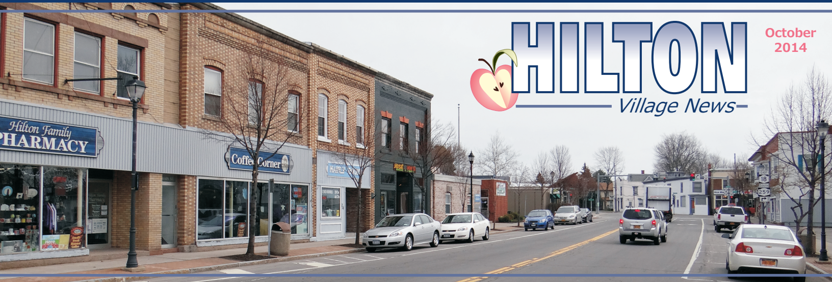
The Little Village with the Big Heart