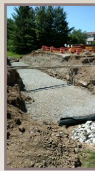
Stone base, preparation for culvert installation.