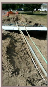
Underground Utilities for the neighborhood lay atop the new culvert.

4 years of planning, 2 of which it took to secure funding, has culminated in the completion of the Carter Drive culvert replacement project.